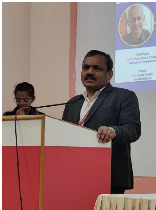
Figure 2: Inaugural Speech by Vice-Principal (Academics), MITS

Following this, the Vice Principal of MITS delivered an inspiring introductory speech, emphasizing the importance of civil services and the need for strategic preparation.