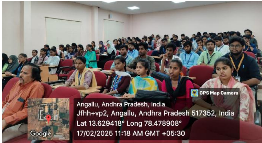
Figure 4: Participants of the Workshop